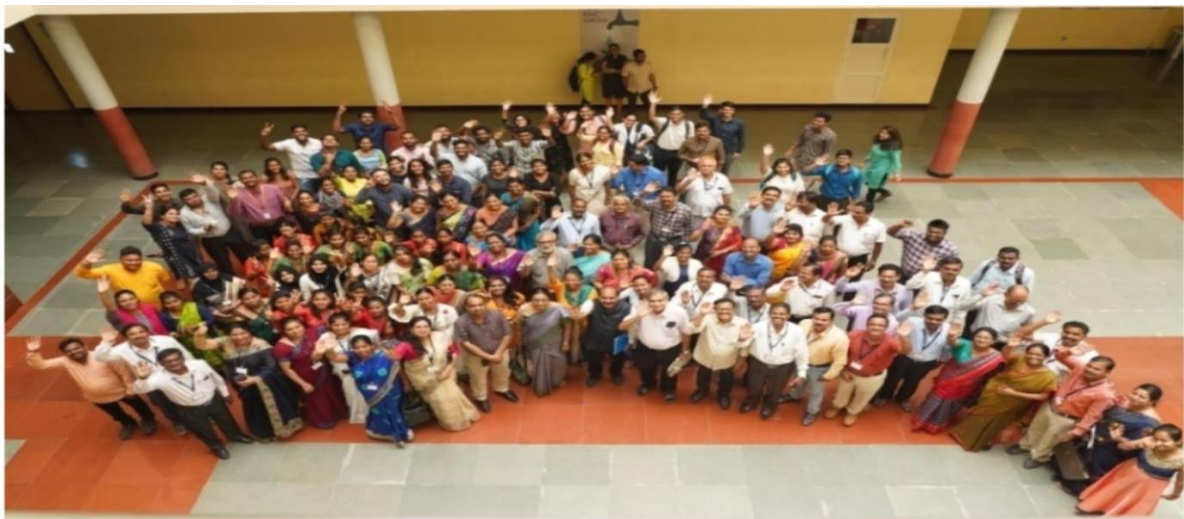
State Level Workshop on New National Education Policy and D'Ed curriculum

With regard to D.Ed One of the added advantage was inclusion of Early childhood education in D.Ed curriculum and Private D.Ed colleges incorporating Induction training module for fresher.