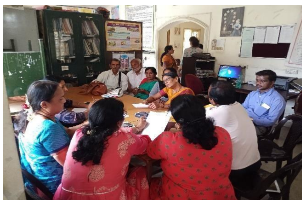
1.1 Federation Meeting

All the eight resource centres are encouraged to develop workable fund mobilization strategy and mechanisms and work on it. They are successful in connecting to multiple sources of funding. Federation along with education centers of Kundapura, Karkala, Sullia, Puttur, Bantwal, Belthagady and with collaboration with Udupi and D.K District Education department will continue the children's cultural group trainings and performance in various places to spread the awareness.