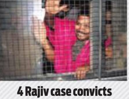
sent to Tiruchy spl camp

However, the breather for Kerala is that no other districts have been included in the SCA scheme. Under the Security Related Expenditure (SRE) scheme, which primarily focuses on catering to the securityneeds of the state, three districts of Kerala-Wayanad, Malappuram and Palakkadhave been counted among the LWE-affected districts.